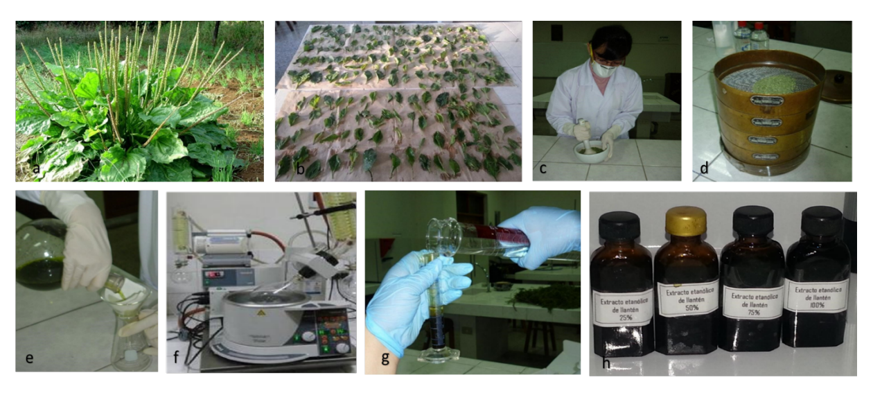
Figure 1. Extract preparation: A. Plantago major; B. Dried in a forced-air circulation; C. Ground with a mortar and pestle; D. Homogenized particle size; E. 70° Ethanol added; F. Soft extract by rotavapor; G. and H. Extract samples.

Subsequently, the leaves were rinsed with sterile distilled water to remove the hypochlorite residue and then placed on Kraft paper and dried in a forced-air circulation oven at 40°C. After the leaves were dried, they were ground with a mortar and pestle until a coarse powder was obtained and then passed through a set of sieves to homogenize the particle size (Figures 1C and 1D). For the preparation of the ethanol extract, 100 g of dried, pulverized and sieved leaves was placed in a 2-litre glass flask, and then 500 mL of 70° ethanol was added, thoroughly mixed and refluxed for 4 hours. After this time, the ethanol extract was vacuum-filtered through Whatman filter paper No. 1. Subsequently, the ethanol extract was concentrated in a rotavapor until a soft extract was obtained (Figure 1E). Then, the extract was dried in a forced-air circulation oven at 40 °C until dry extract was obtained. From the dry extract, 25% (250 mg/mL), 50% (500 mg/mL), 75% (750 mg/mL) and 100% (1000 mg/mL) extract samples dissolved in 70% ethanol were prepared. Finally, the ethanol extracts were stored in amber-coloured glass bottles and refrigerated at 4 to 8°C until further use (Figures 1G and 1H).